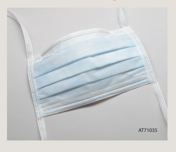
Not made with natural rubber latex