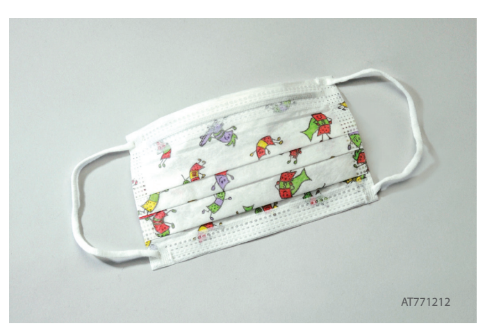
Not made with natural rubber latex