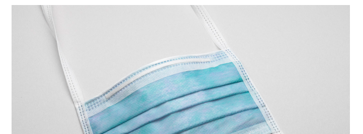
Not made with natural rubber latex