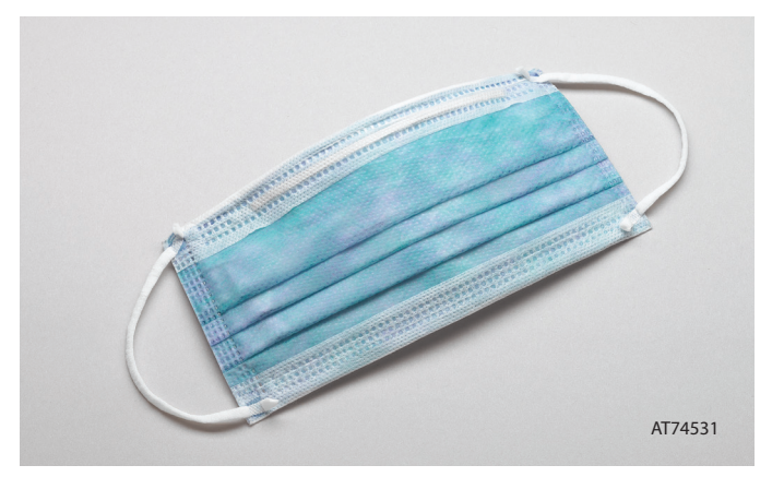
Not made with natural rubber latex