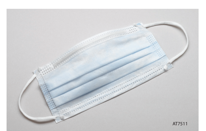
Not made with natural rubber latex